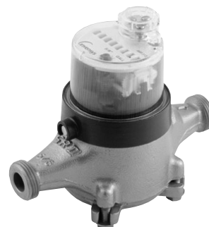
5/8" SR II-EB AMR (pictured) 3/4" and 1" available